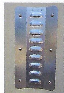
When done, the outside should look like this.

Carefully align the vent to the mounting holes. Utilizing an assistant on the inside of the container, align the screen also with the mounting holes. Insert one of the screws through the vent and through the screen. Install a flat washer then a locknut on the screen. Tighten the locknut just finger tight. Install the remaining screws, washers, and nuts. Once all 6 are installed, tighten with a #2 Phillips screwdriver and a 3/8 inch wrench, socket, or nut driver, just enough to bring the vent flat against the container wall. Wipe off excess silicone. If the silicone didn't fill the entire gap between the vent and container on the top and sides, add more as needed. Silicone around the screen as well if it is not flat against the container wall on all 4 sides.