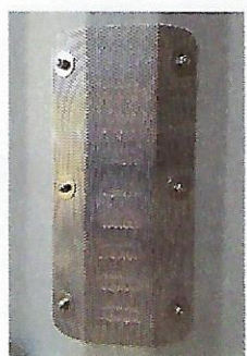
And the inside should look like this.